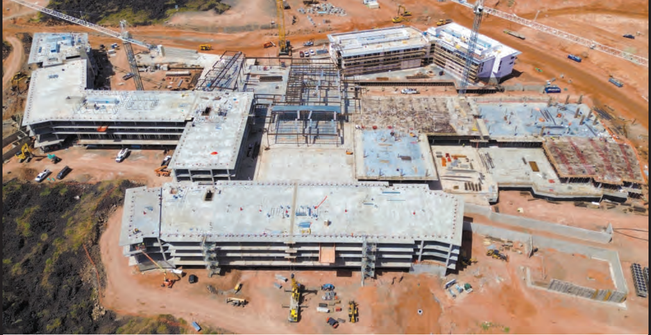
Baker Construction Enterprises ( No. 15 ) is providing foundation work and building elevated decks on the Black Desert Resort in Ivins, Utah. The firm will provide 1 million sq ft of structural slabs, along with 45,000 cu yd of concrete, 7.5 million lb of rebar and 500,000 lb of post-tension cables. The 600-acre resort is due to be completed in fall of 2024.

year to come is to maintain similar production levels while continuing to offer a quality product.”